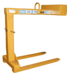
"PL" Series Pallet Lifter

Specify hook size when ordering to ensure compatibility with lifting bail size.