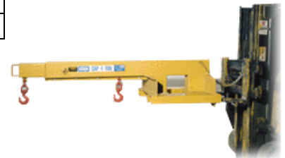
"JLT" Series Telescoping Jib Lift

IMPORTANT TRUCK FORKS MUST EXTEND THROUGH FULL LENGTH OF FORK TUBES